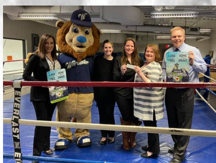
Boys & Girls Club