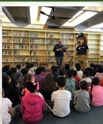
Ticket to Read

Ticket to Read: This program supported by Chick-fil-A encourages students to read books in an effort to earn free tickets to Worcester Bravehearts and Worcester Railers games. Over 9,000 students from 34 different schools participated in this program, reading a cumulative total of 18,289 books.