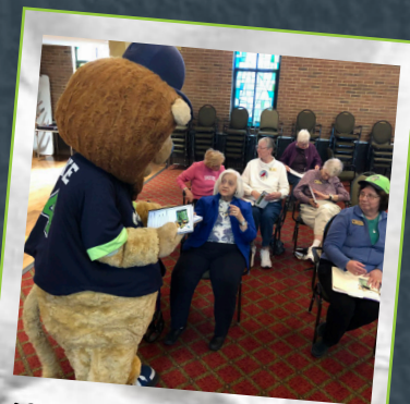
Pen Pal Club